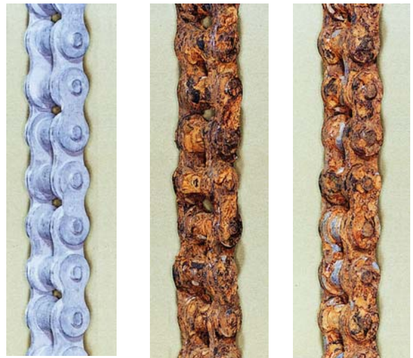
Chain after 504 hours elapsed